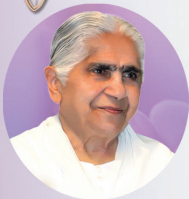
Dadi Janki Chief Brahma Kumaris