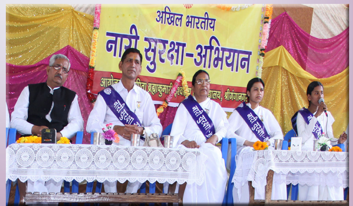
Sri Ganganagar – BK Sister is Addressing during Nari Suraksha Abhiyan