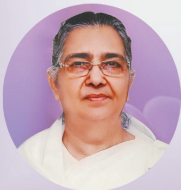
BK Chakradhari Chairperson Women's Wing